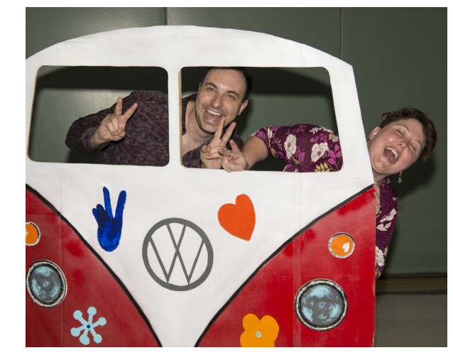
Test your skills... Who Are These People?