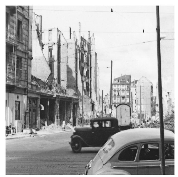
Frankfurt street scene in 1948. World War II damage is still very Evident.

The people of Frankfurt go about their business against a backdrop Of the Cathedral of St. Bartholomew, which suffered massive damage from Allied bombing in WW-II. The cathedral has since been rebuilt.