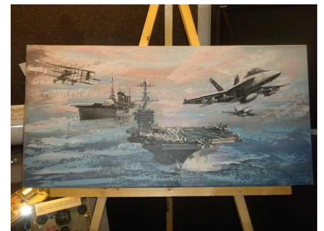
"Centennial of Naval Aviation"